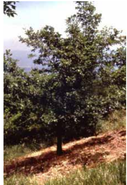
Apr oductivetruf fleoak

produce fruit bodies (carpophores) identical to those found in Nature. The term “truffle cultivation” therefore indicates the “specialized” cultivation of mycorrhized plants, obtained by the constant application of specific cultivation techniques, which are the results of the research work carried out so far. Among the numerous truffle species present in Europe, only a few show a commercial interest: the white truffle ( Tuber magnatum Pico), the rare black truffle ( Tuber melanosporum Vitt.), the winter truffle, and