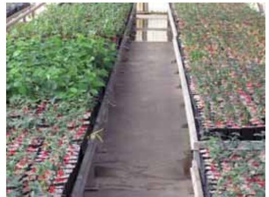
the interior of a greenhouse for truffle-producing plantlets

It shows a smooth, beige to fulvous peel; the flesh is light coloured, with fulvous-violet nuances and beige round branched veins. It has a garlic-like aroma. It ripens between January and the middle of April.