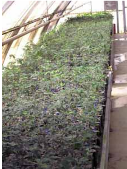
truffle-producing plants in a greenhouse

Truffles are fruit bodies produced by hypogeous fungi of the genus Tuber (Ascomycetes) that in Nature are spontaneously formed in certain environments, in association (mycorrhizal symbiosis) with some forest plants such as oaks, hornbeams, hazelnut trees, linden trees, cedar trees, pines, poplars and willows. This symbiosis, observed in both arboreal and herbaceous plants, leads to the formation of structures known as mycorrhizae, through which both organisms achieve a mutual benefit for their development. On the basis of nowadays knowledge it is possible to induce a symbiosis between various plants and several Tuber species (mycorrhized plants). These plants, cultivated on soils suitable to both plant and truffle, can