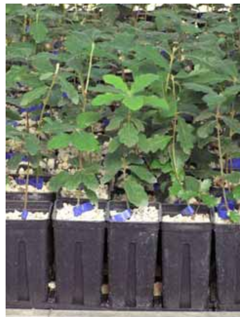
Truffle oaks mycorrhized with the rare black truffle

Every year, all the plants present in the garden centre must undertake quality controls, to verify their degree of micorrhization, prior to their marketing. Quality controls should be carried out by public organizations of reknown professionalism (Universities, Research Centres, etc) rather than by private bodies, where a conflict of interest may exist. Only well developed plants, characterised by a good foliage to root system ratio, will be commercialised with the truffle cultivation suitability certification, once the root mycorrhization will have reached the standard level.