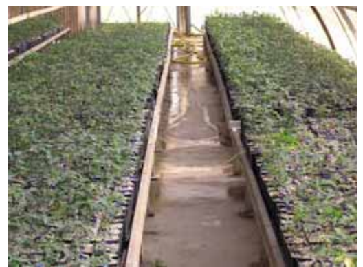
Cultivation of truffle fleoaks