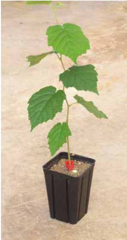
Hazelnut tree mycorrhized with the summer truffle

their productivity when they reach senility) and a different production starting time. The plantation density depends on the forest plant and the truffle species utilized. As an indication, oaks have a plantation density of 300-500 plants per hectare when placed in a square pattern or in alternate rows. A lower density is preferable in level fields, with N-S orientated rows.