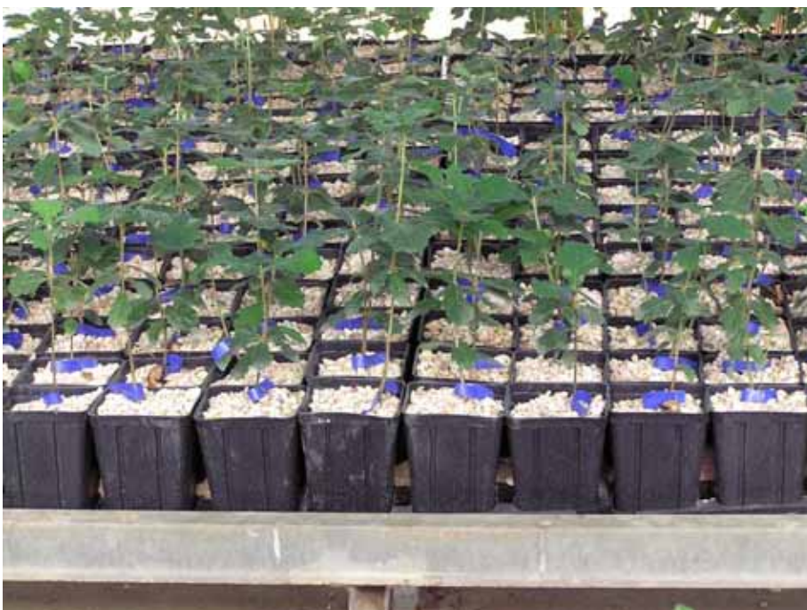
Truffle oak mycorrhized with the rare black

species, can be transplanted either at the beginning or at the end of winter. It is important to carefully remove the pot in order not to damage the mycorrhized root apices. The best technique envisages to transfer the plantlets in hollows (30x30 cm) the bottom of which is covered by gravel, hollows being consequently filled with the removed soil.