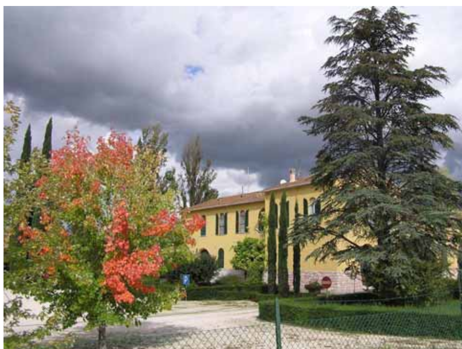
The farm centre of "Il Castellaccio"

This truffle is less demanding in terms of environmental needs than the white truffle, and it is therefore more present both in plains and in mountains, up to over 1000 m a.s.l. It prefers sandy soils with a sub-acid to sub-alkaline pH (pH 6,2-8,2) and it is often associated with conifer plants as symbionts.