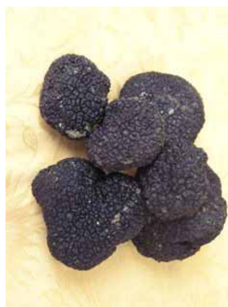
Tuber aestivum Vitt. forma uncinatum Chatin uncinatum truffle