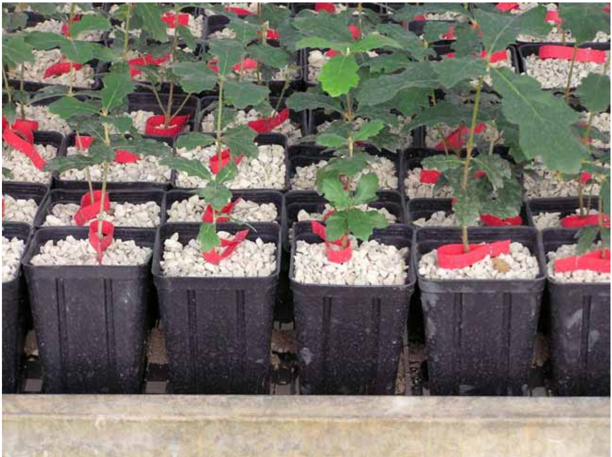
Truffle oak mycorrhized with the summer truffle

in particular, prefers extremely thin, calcareous soils, derived from rocks of the Mesozoic era, characterised by an alkaline pH (pH 7,6-8,2), abundant gravel and stones, a fair clay content, good permeability, a low or average humus, nitrogen and potassium content, a sufficient supply of phosphorus. The most suitable areas are placed at an altitude between 400 and 1000 m a.s.l., with a slope to avoid stagnant water, exposed to South, South-East or South-West in