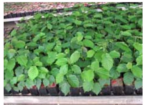
Details of a nursery